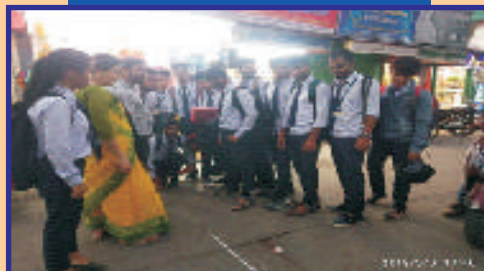
Field Visit of Geography