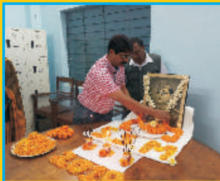
SUBHASH CHANDRA BOSE'S BIRTHDAY ON 23RD JAN