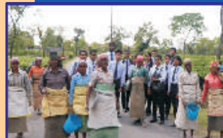
Field visit of Political Science