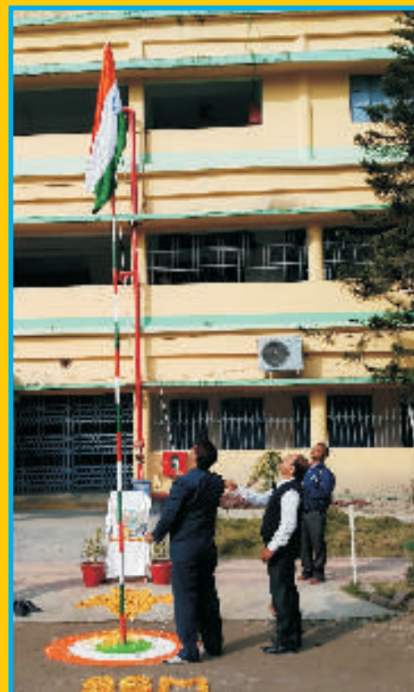
COLLEGE OBSERVED 70TH REPUBLIC DAY ON 26TH JAN 2019