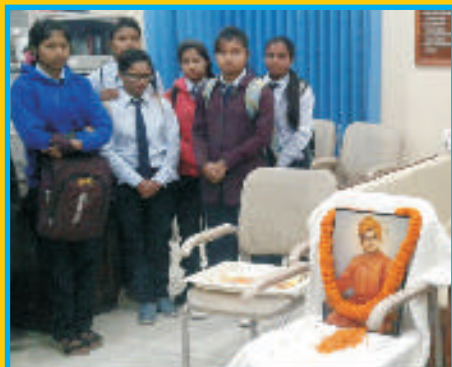
VIVEKANANDA'S BIRTHDAY ON 12TH JAN