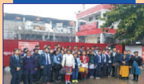
Industrial Visit (Commerce)