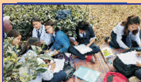
Field visit of Sociology