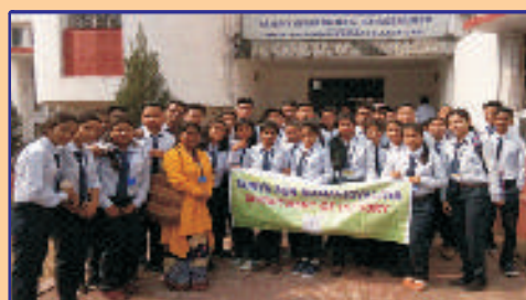
Museum Visit (History)